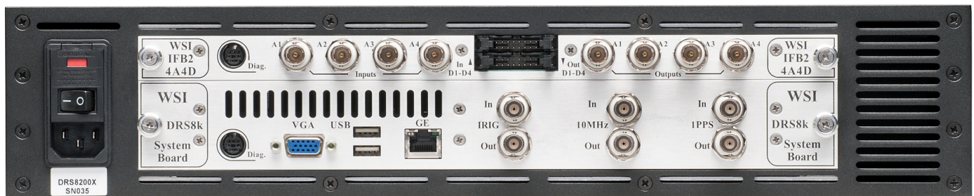
*All system boards now come standard with a Display Port and dual USB 3.0 ports. VGA is no longer offered as a standard video output.

Can be provided quickly and cost-effectively